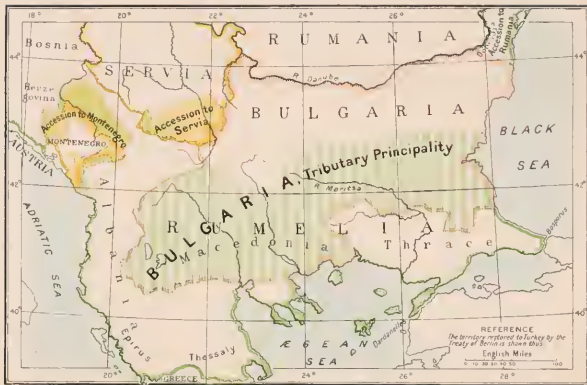
DIAGRAM TO ILLUSTRATE THE TREATY OF SAN STEFANO